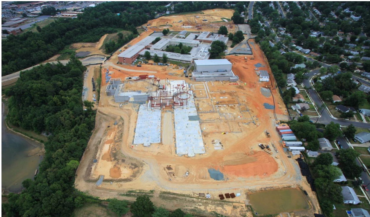
Figure 1: Progress Photo 07/14/2012

The demolition of the existing school will start after the new building is turned over to the owner and the space has been occupied in August of 2013. After the building has been removed a permanent parking lot and bus loop will be installed. It is also during this time that the sports fields will be completed.